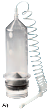
200 ml Qwik-Fit Syringe® disposable with Priming tube